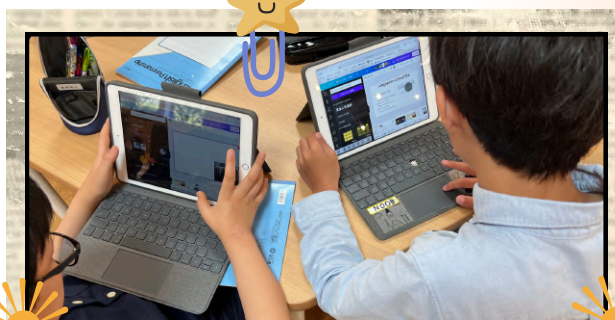
We're busy preparing presentations, and brainstorming fun activities to make their visit memorable.