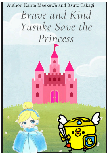
KANTA MAEKAWA & ITSUTO TAKAGI

This was also the last week for students to finish their English Storybook Project. Students had the opportunity to express their creativity and hone their language skills at the same time. The stories were captivating, humorous, and at times, a little disturbing. It was incredible to watch students work hard to overcome schedule changes and meet deadlines. Parents can expect their student to tell them more about their book next week at the Parent’s Meeting!